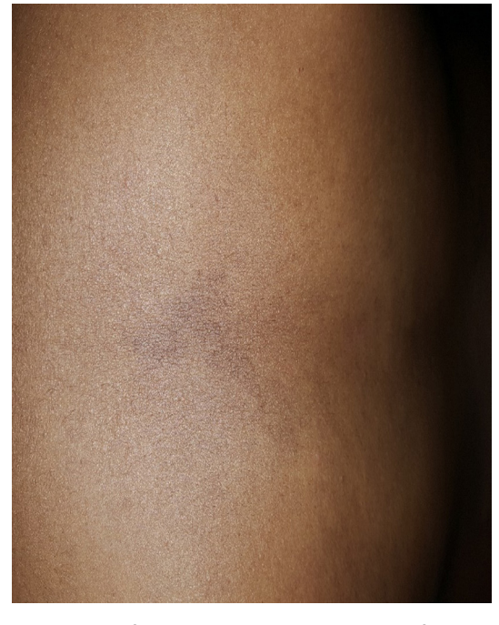
Figure 1 Café-au-lait spots in the middle line of the back.

of endocrine disorders; precocious puberty (PP) being