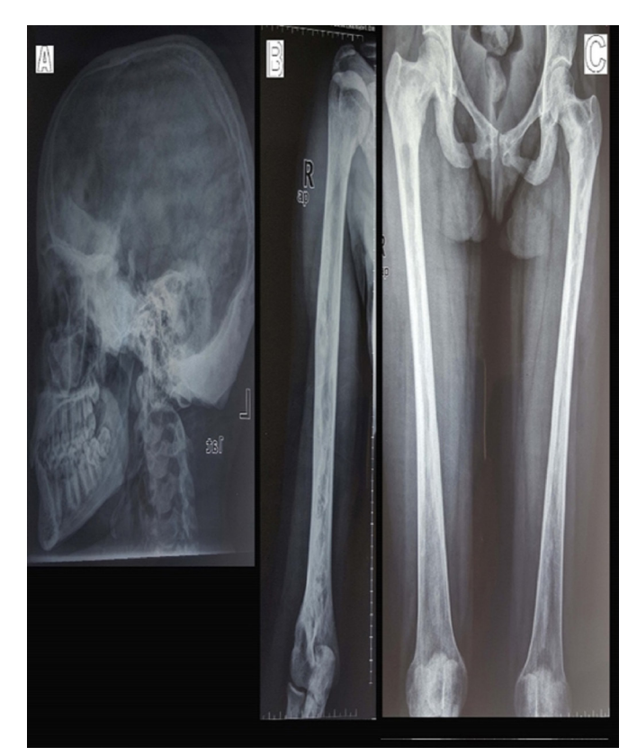
Figure 3 (A) Skull: sclerosis and expansion of the frontal bone and floor of the anterior cranial fossa extending into the sphenoid bone. Marked thickening and sclerosis of the occipital bone and posterior parietal bone. (B) Humerus: thickening of the cortex of the diaphysis, cystic lesions with thickened sclerotic rind in the methadiaphysis. (C) Femur: patchy sclerosis and expansion of the neck of both right and left femur, cortical thickening, scalloping and ground glass with radiolucency in the diaphysis bilaterally.

The patient was treated with bisphosphonates in the form of ibandronate at a dosage of 150 mg monthly to reduce the risk of pathological fractures for over the past 1 year of follow-up.