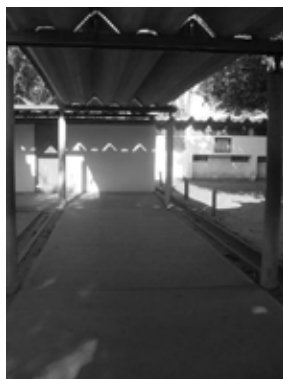
Figure 18: Shaded pathway / outdoor corridors