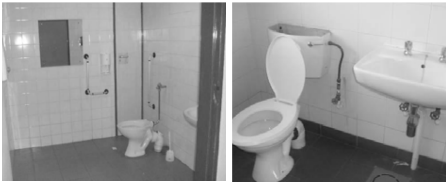
Figure 13: Accessible toilets but high accessories

Toilets were found to be generally available at different floor levels. Only eight buildings had toilets reserved for people with special needs. However, only four of those had space to transfer from the wheelchair to the toilet. Seven buildings had washbasins with knee space and taps reachable from a seated position. The toilets had grab bars but some items and accessories such as light switches, mirrors, toilet paper holders, soap dispensers, and hand dryers were too high (Figure 13).