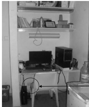
Figure 17: Accessible study table and high book shelves