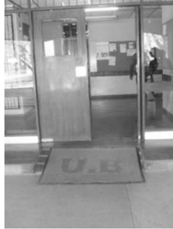
Figure 8: A well maintained and not so well maintained dropped kerb