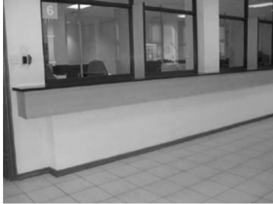
Figure10: Smooth ramps but high counters at food court eatery