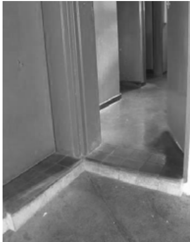
Figure 15: An access hindering gate at Block 480