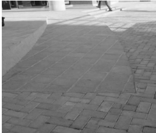
Figure 2: Good gradient shaded ramps with handrails and non-slippery flooring – Administration building