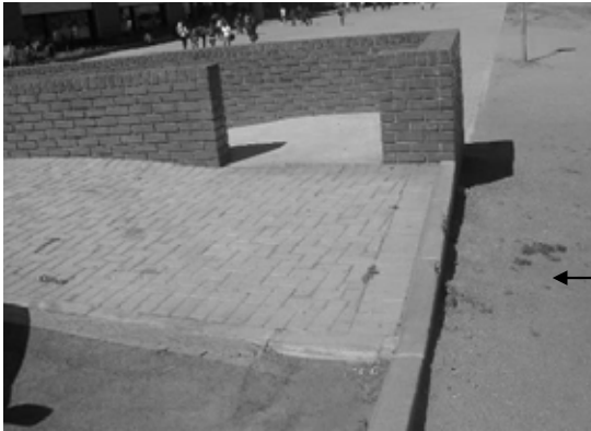
Figure 4: Ramps with no dropped kerb, no handrails, and no shade

No dropped kerb for smooth transfer at the end of the ramp