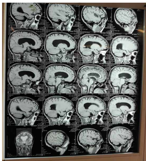
Figure 1: Minimal ventricular enlargement with a conclusion of mild hydrocephalus.

His head circumference was 99 cm. Brain magnetic resonance image (MRI) was done which showed minimal ventricular enlargement with a conclusion of mild hydrocephalus (Figure 1). He was put on steroid treatment. The neuro-surgeon was consulted and a Ventriculo-peritoneal shunt operation was done successfully on the fourth post operation day. Intra-operative finding showed a gush flow of cerebro spinal fluid with increased pressure. On recovery from the anaesthesia he noted that his vision was a little blurred, but progressively his vision cleared and was able to see clearly. Repeat MRI after surgery showed the catheter in situ and drainage of the accumulated CSF from the ventricles (Figure 2).