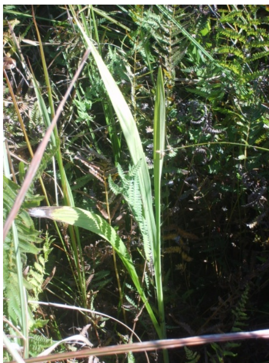
Figure 2. Eulophia angolensis in the Okavango Delta (Photo taken by Authors).