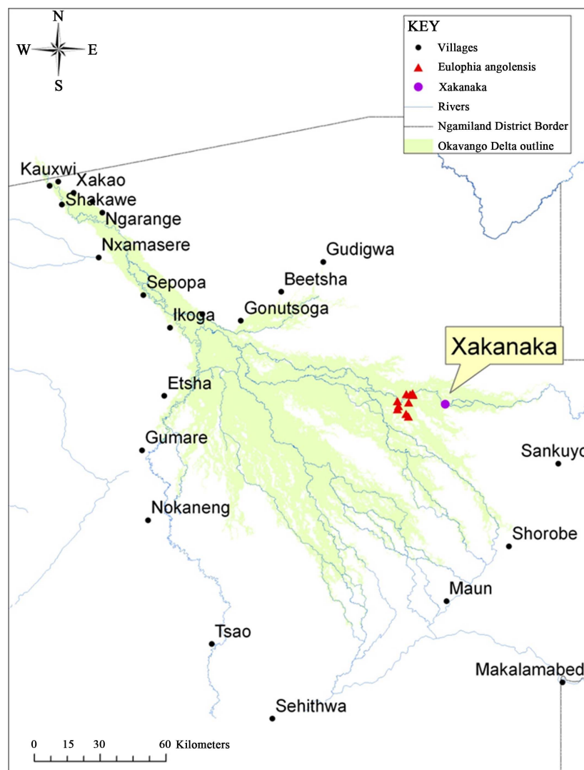
Figure 1. Location of the study area showing the sites where E. angolensis occurred.