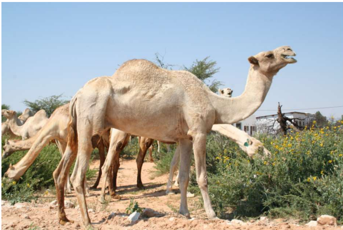
Figure 2: Imported camels for new nature-based tourism operations in Tshabong, Botswana.

Similarly, Tshabong interviewees mentioned wildlife to be a major attraction to tourists visiting their area. In addition they alluded to the existence of a new product, the camel rides tourist product (Figure 2.). Further, Tshabong had potential sand dunes products that were assumed to have a major pull especially for tourists from South Africa. One of the interviewees said that "people come from outside our village especially South Africa bringing their quad bikes and race on the sand dunes without paying for them".