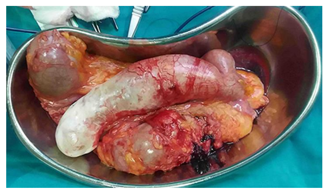
Figure 2: Surgical specimen